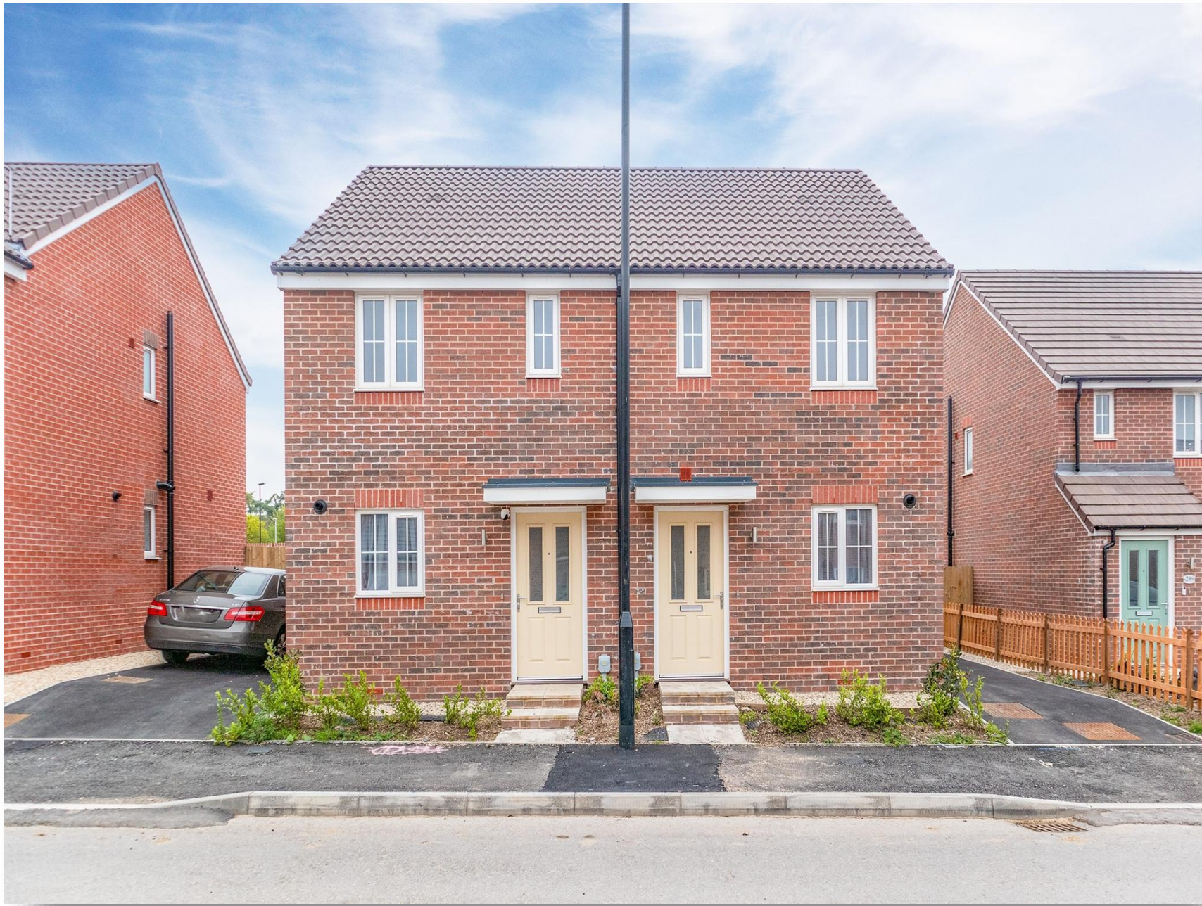
Homington Avenue, Coate, Swindon, SN3 6GE