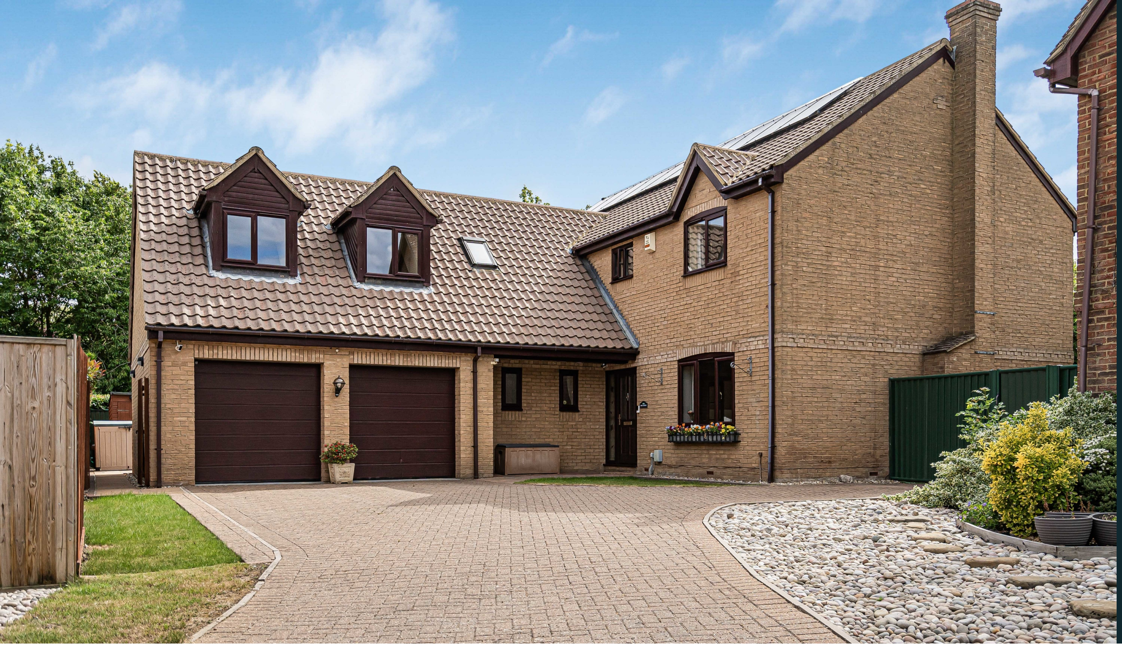
4 Sadlers Close Hardwick