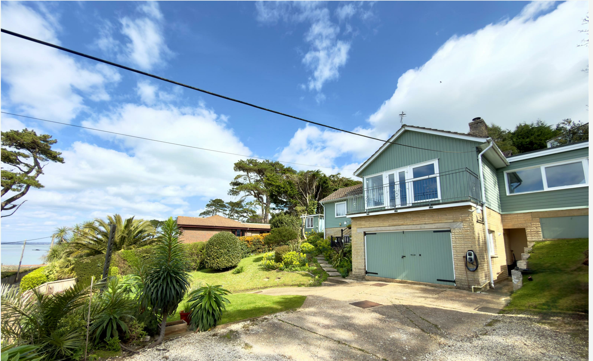
Solent Pines, Cliff Road, Totland Bay, Isle of Wight