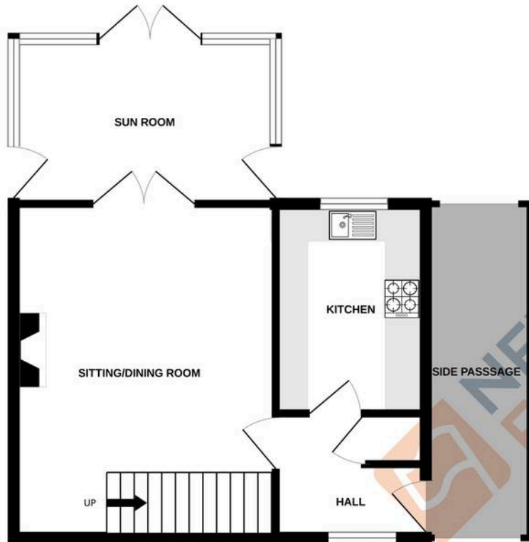
GROUND FLOOR 425 sq.ft. (39.4 sq.m.) approx.