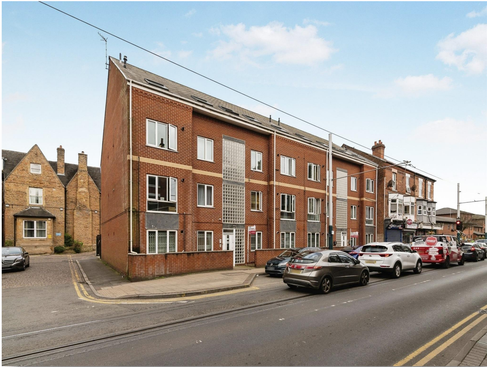
Radford Road, Nottingham NG7 5GN