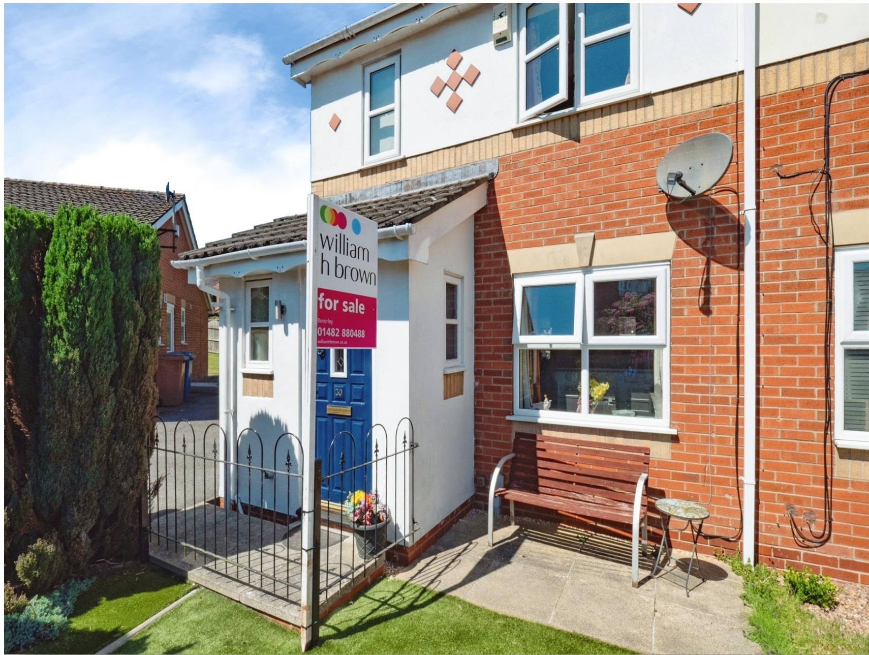
Bramble Hill, Beverley, HU17 8UZ