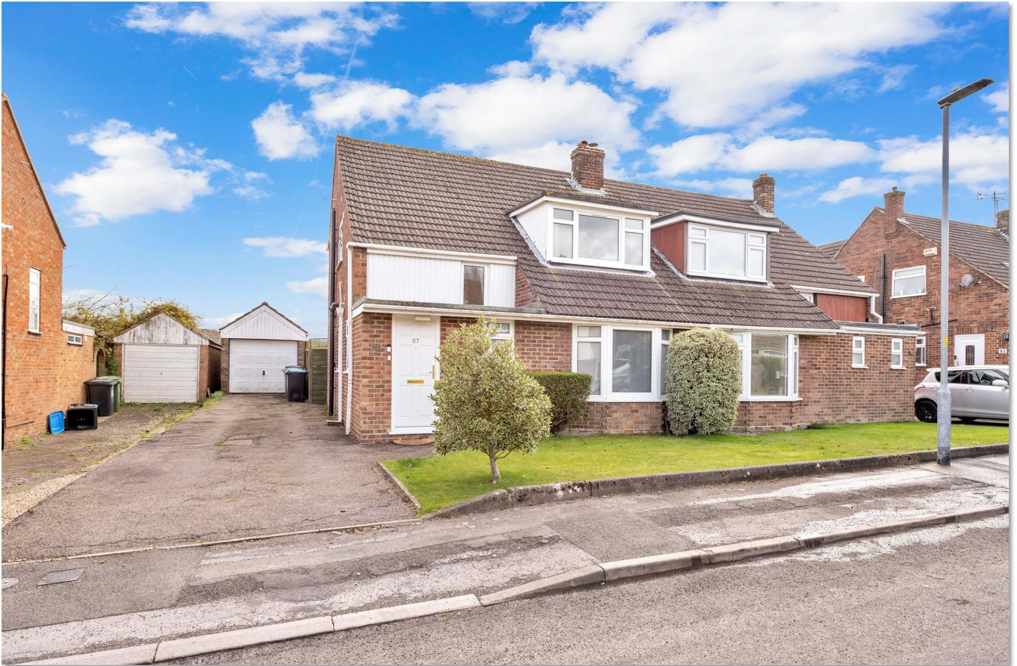
Mill View Road, Tring HP23 4EW