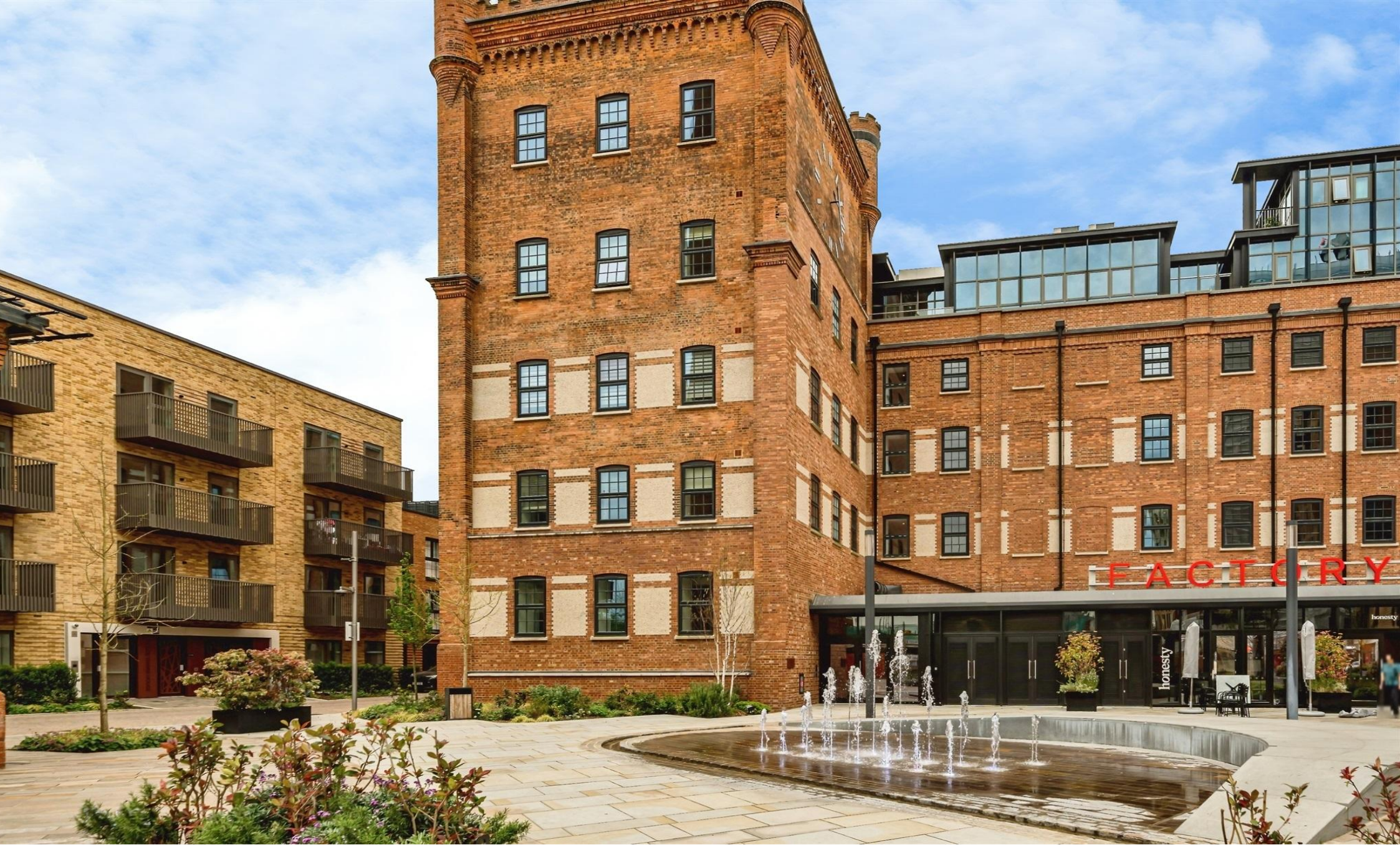
The Factory Memorial Avenue, Slough SL1 3GY