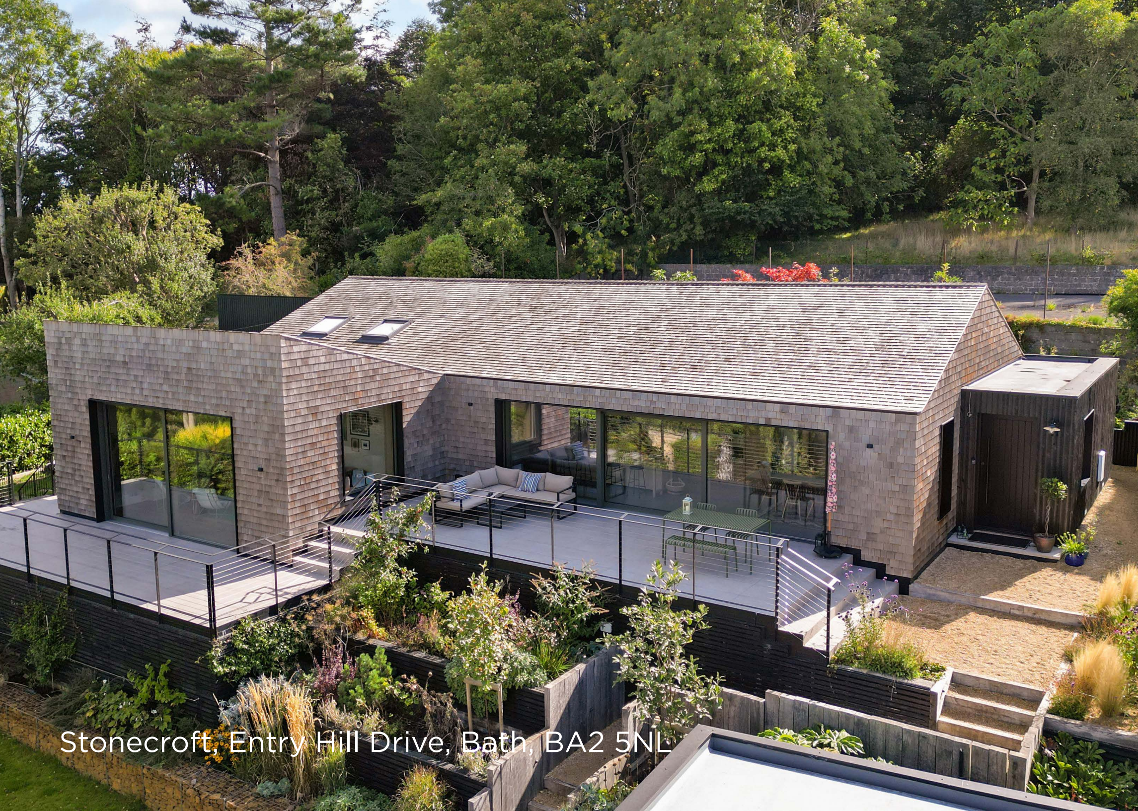
Stonecroft, Entry Hill Drive, Bath, BA2 5NL