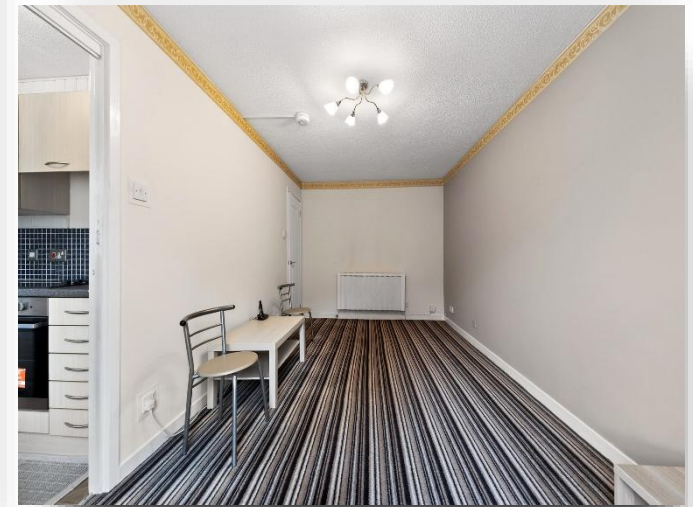
Burnhill Quadrant, Rutherglen GLASGOW G73 1ER