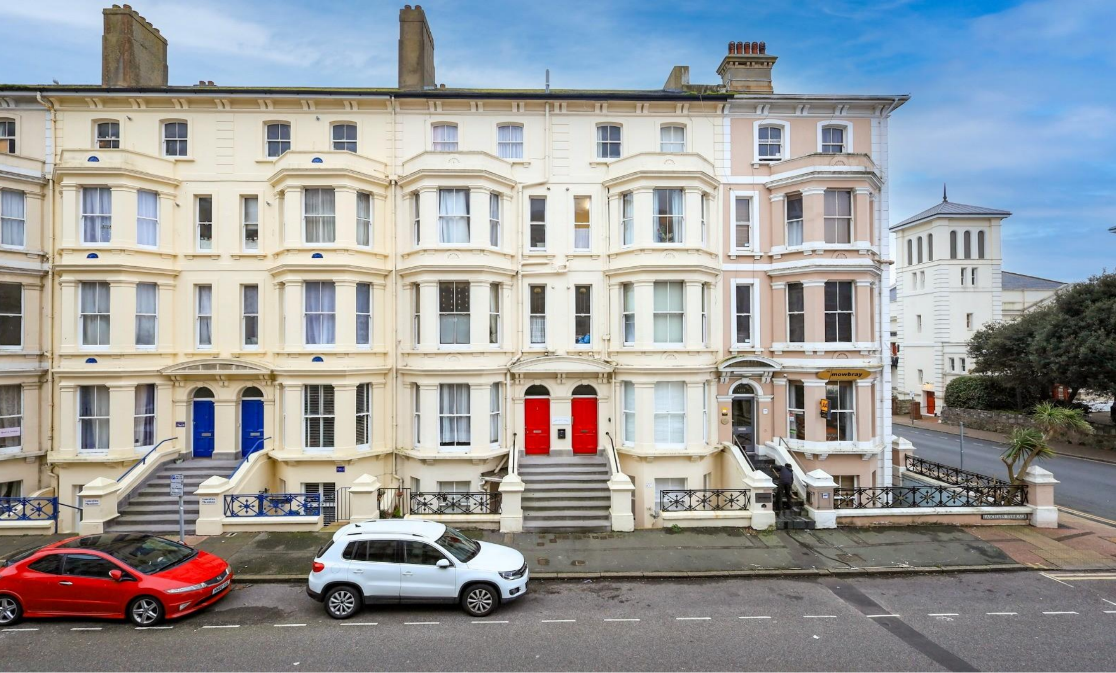
Mowbray Court Lascelles Terrace, Eastbourne BN21 4BJ