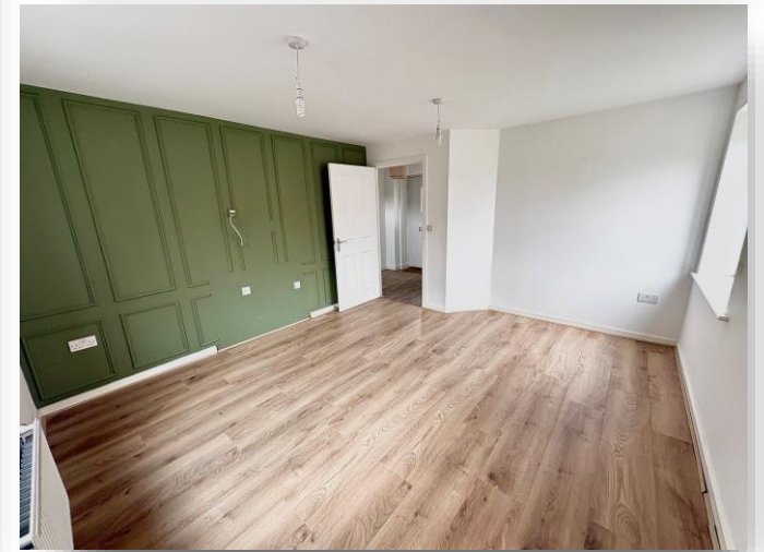
Fairhaven, Hampton Gardens Peterborough PE7 8RF