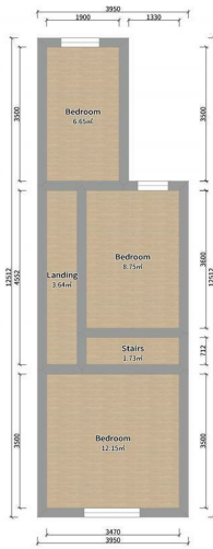
Milner Road First Floor