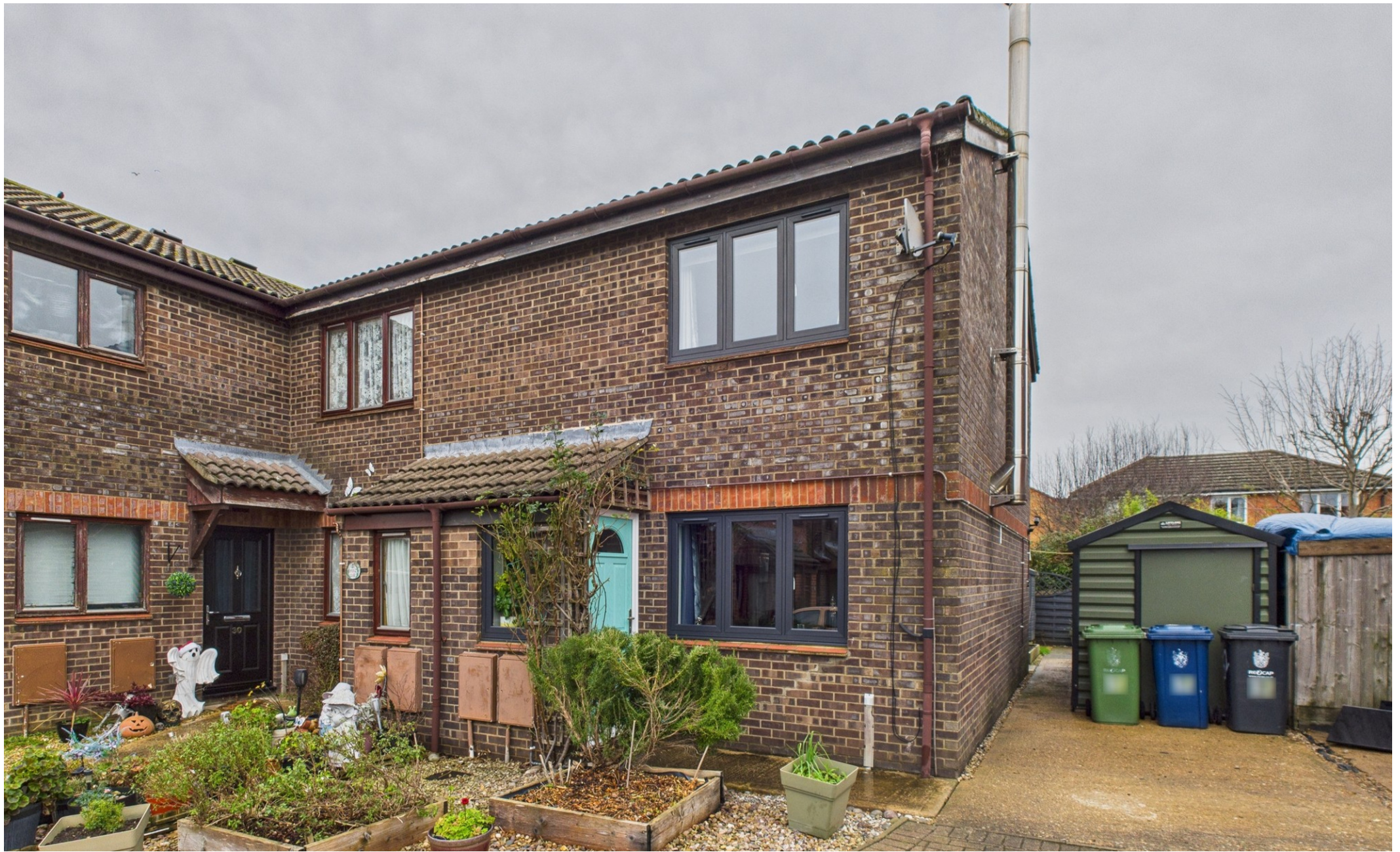
Stevens Close, Cottenham CB24 8TT