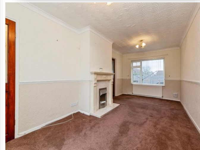
Dunbar Road, Billingham TS23 2EL