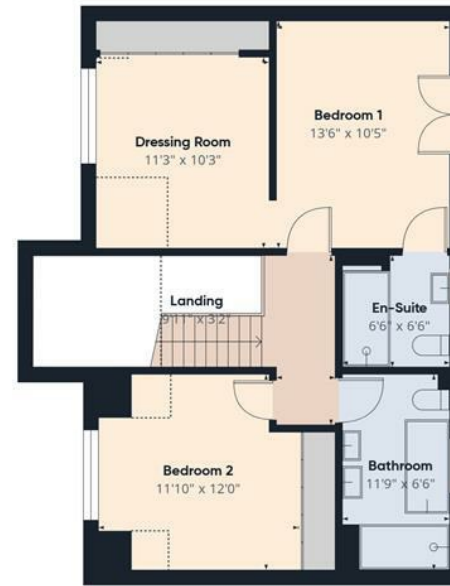
First Floor Building 1