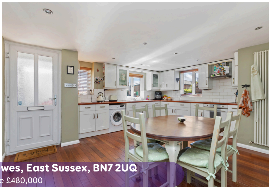
Wheatsheaf Gardens, Lewes, East Sussex, BN7 2UQ Asking Price £480,000