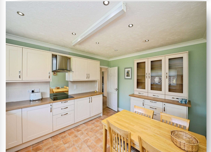
Bluebell Drive, Snettisham, PE31 7UB