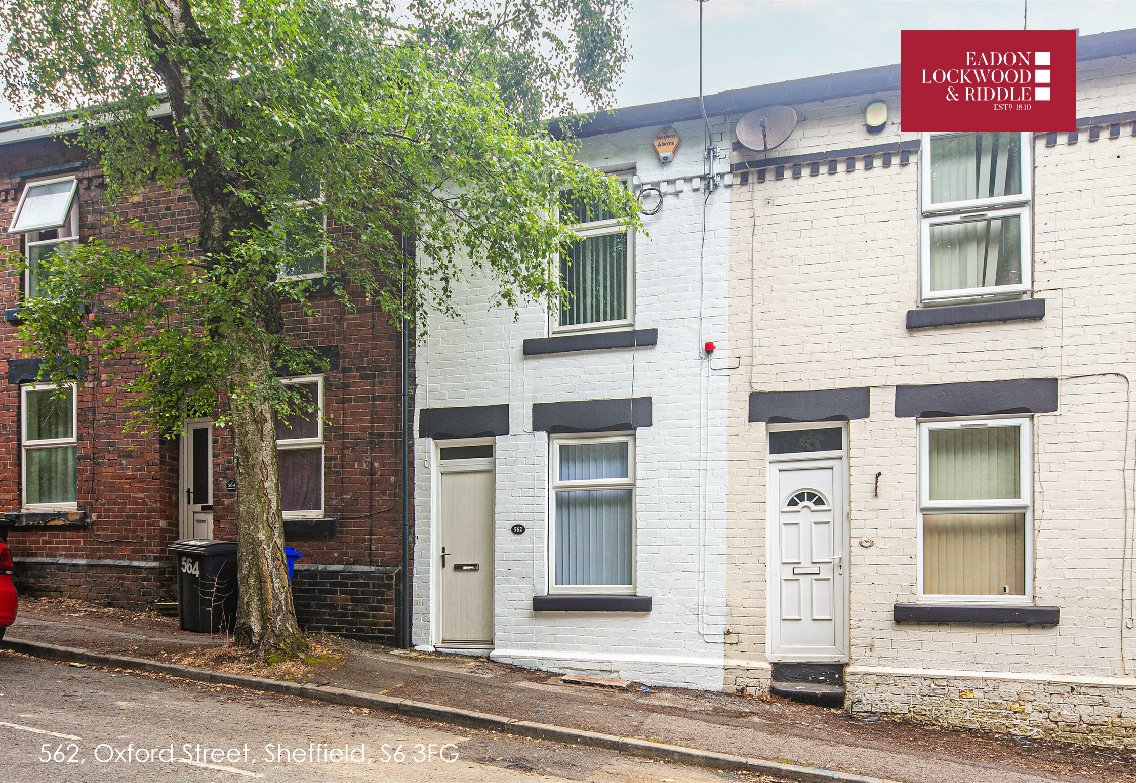
562, Oxford Street, Sheffield, S6 3FG