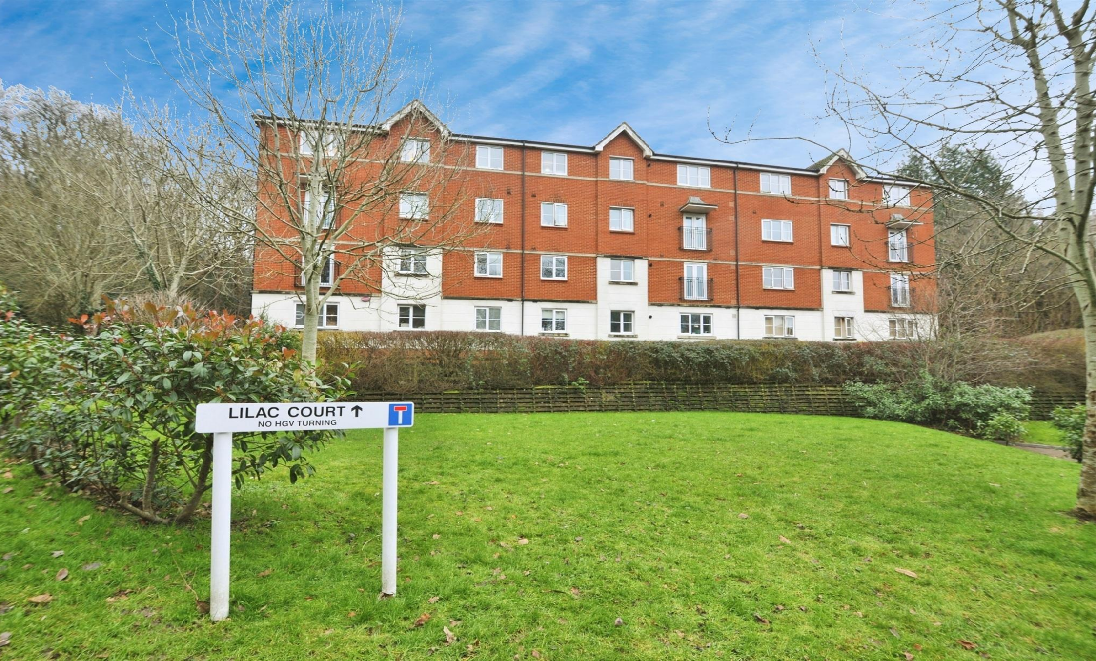
Lilac Court - Arbourvale, St. Leonards-On-Sea TN38 0FN