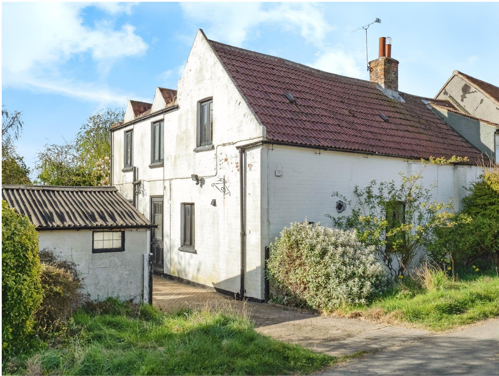
Newbridge Road, Burstwick, Hull, HU12 9HS