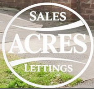
24 Pilkington Avenue, Sutton Coldfield, B72 1LA