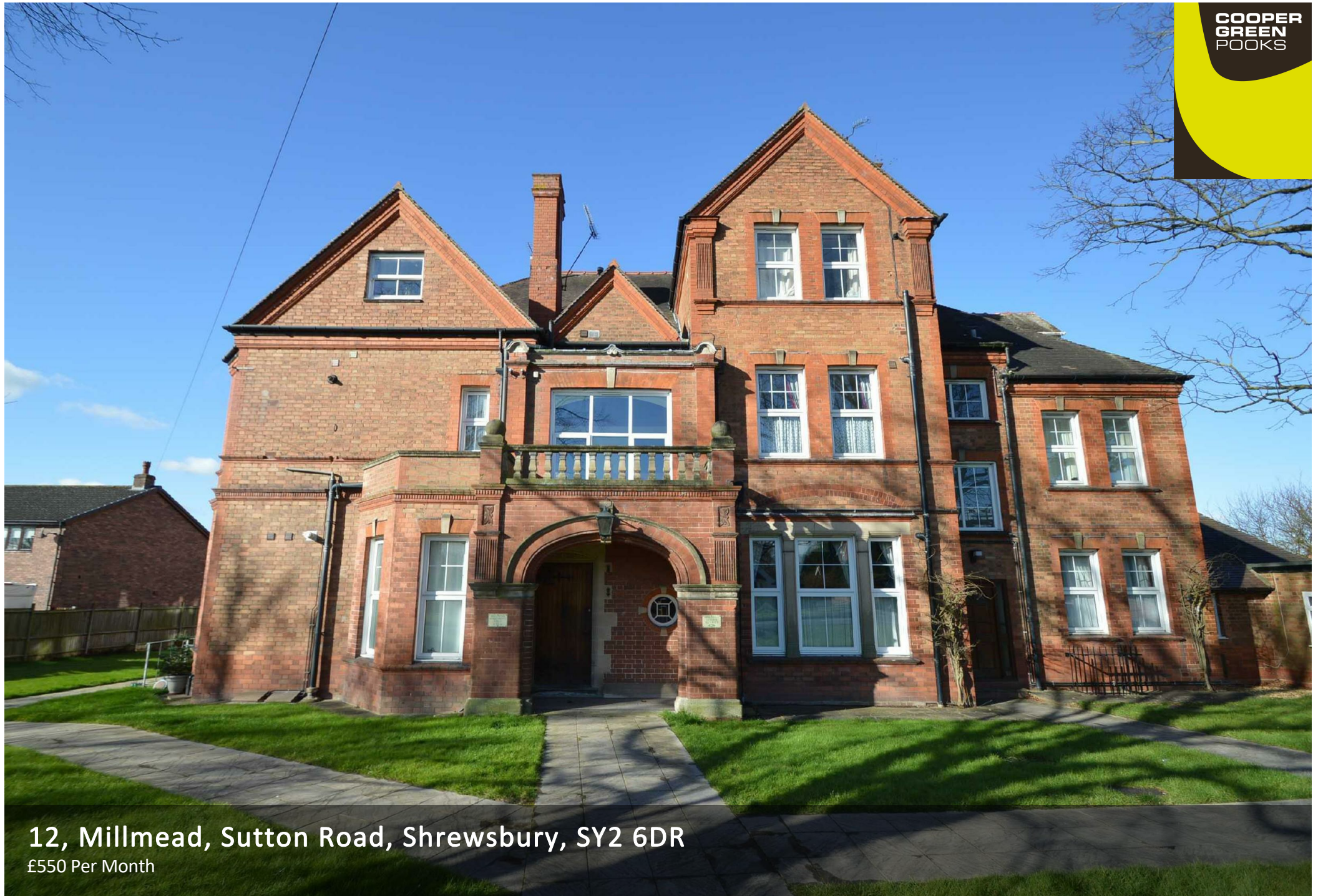
12, Millmead, Sutton Road, Shrewsbury, SY2 6DR £550 Per Month