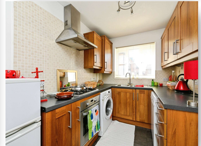
Benstead Close, Heacham, PE31 7FB