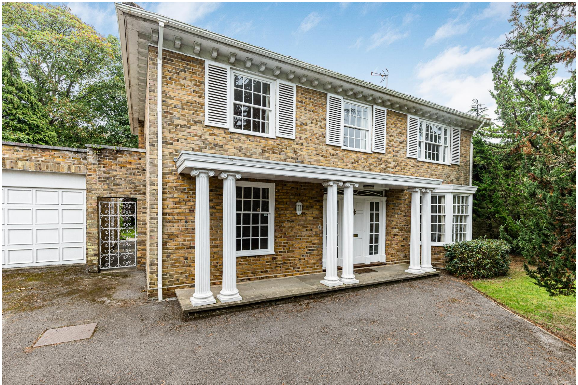
Rolfe Place, Headington