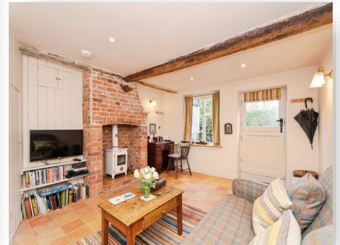
Marlpit Cottages Marlpit Lane, Holt NR25 6TR