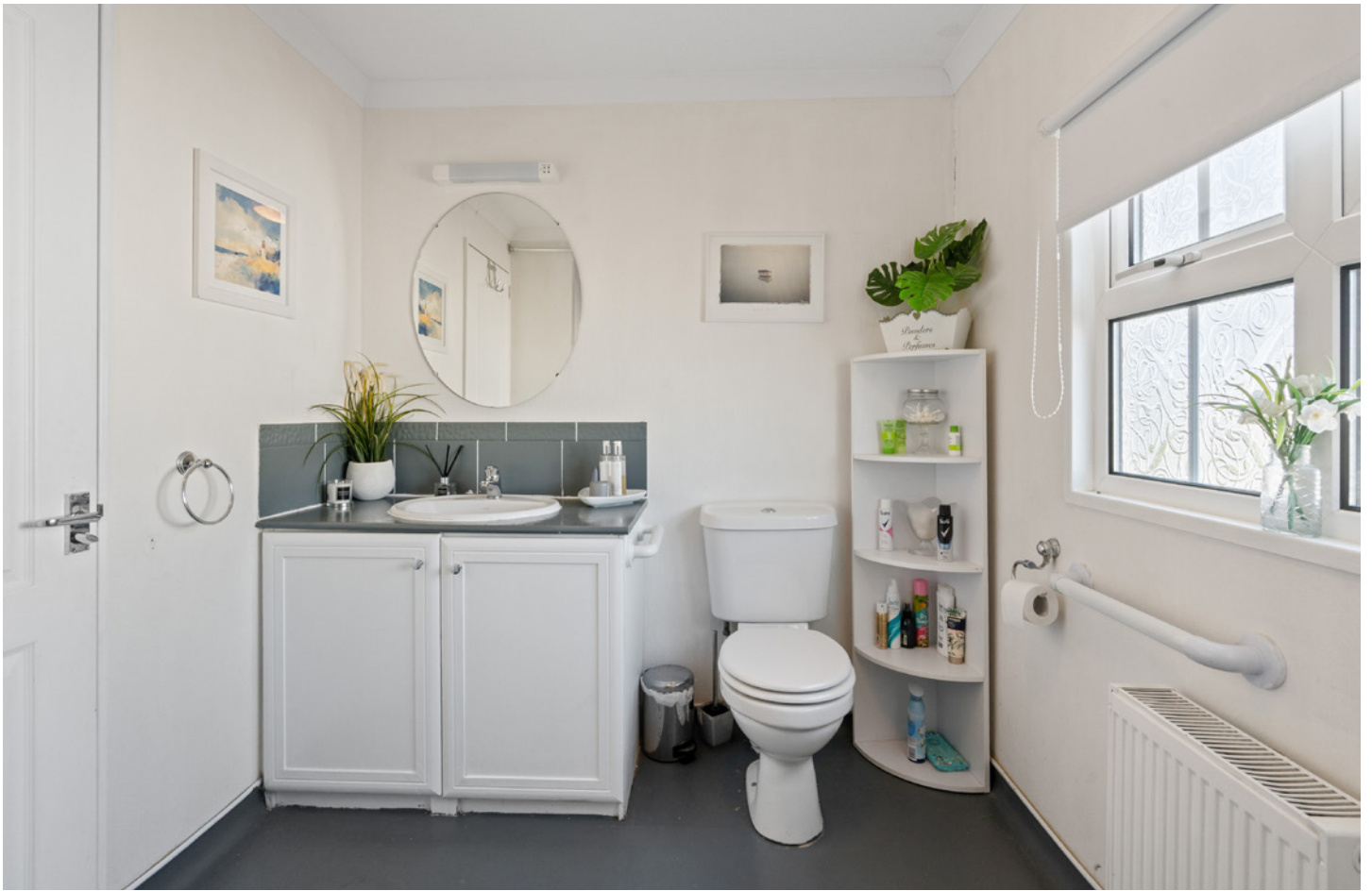
One bathroom with a modern walk-in shower suite designed for accessibility and comfort. A welcoming hallway providing access throughout the home and additional storage space.