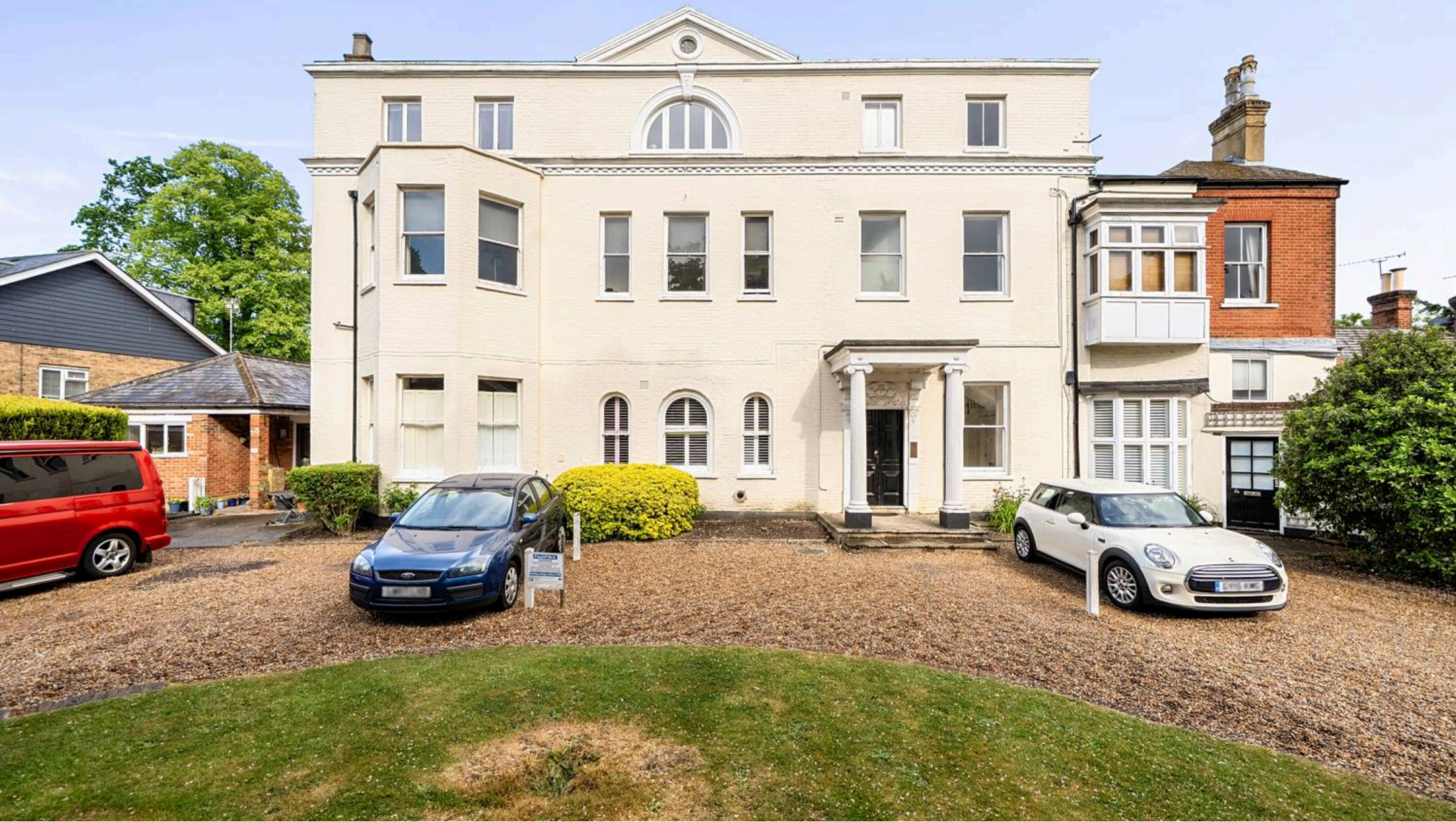
Woodcote Hall, Woodcote Road, Epsom