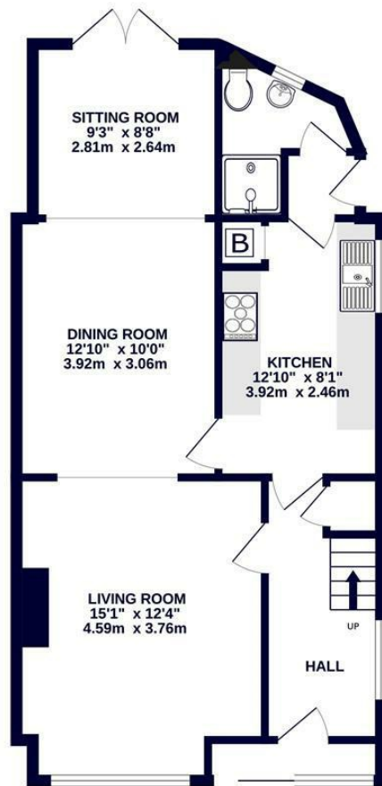
GROUND FLOOR 626 sq.ft. (58.2 sq.m.) approx.