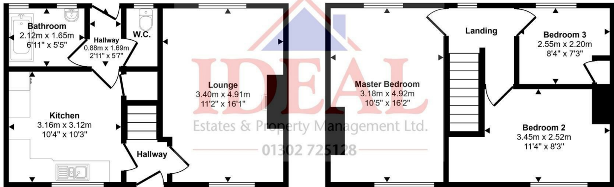
Ground Floor Approx 38 sq m / 409 sq ft

Approx Gross Internal Area 76 sq m / 823 sq ft