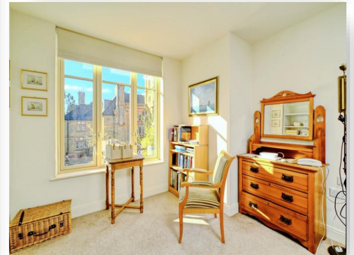
Garnier Drive, Bishopstoke, Eastleigh. SO50 6HE