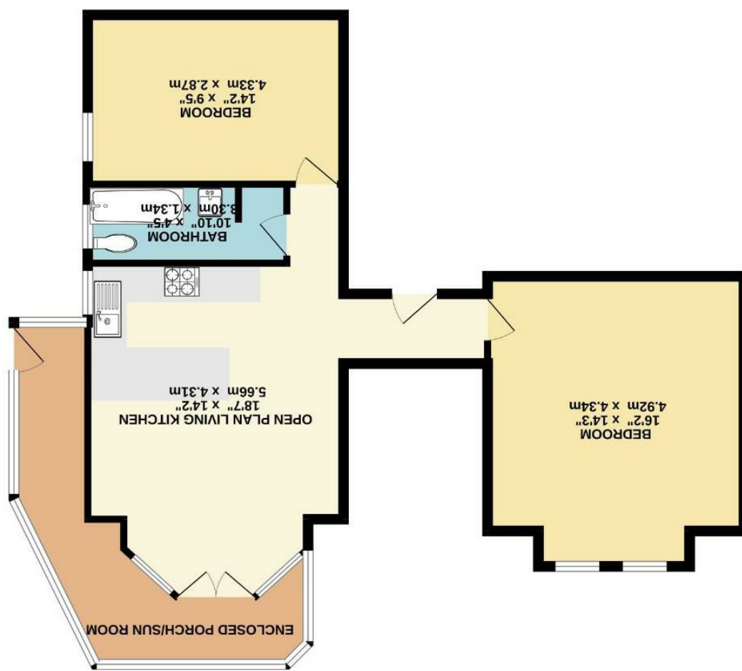
802 sq.ft. (74.5 sq.m.) approx.

Fishwick nor the vendor or lessor accept any responsibility in respect of these particulars, which are not intended to be statements or representations of fact and any intending purchaser or lessee must satisfy himself by inspection or otherwise as to the correctness of each of the statements contained in these particulars. Any floorplans on this brochure are for illustrative purposes only and are not necessarily to scale.