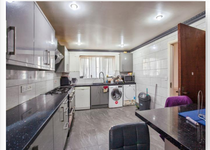
Nabeel Court, Broom ROTHERHAM S60 2PL