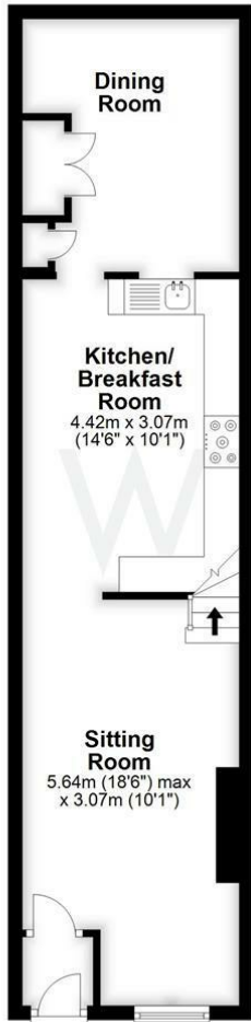
Ground Floor z Approx. 42.3 sq. metres (455.4 sq. feet)