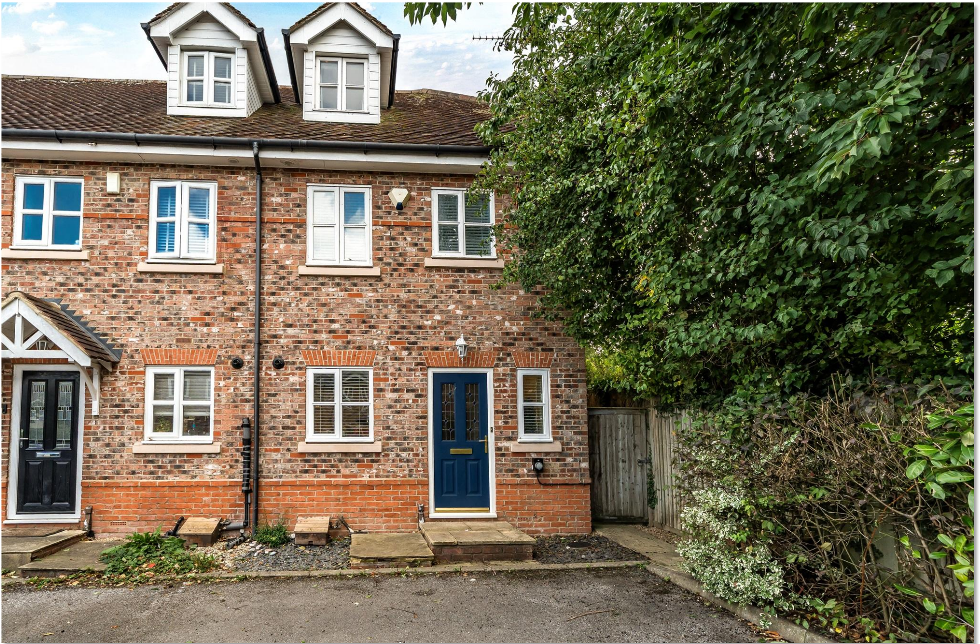
Applecroft, Northchurch Berkhamsted HP4 3RX