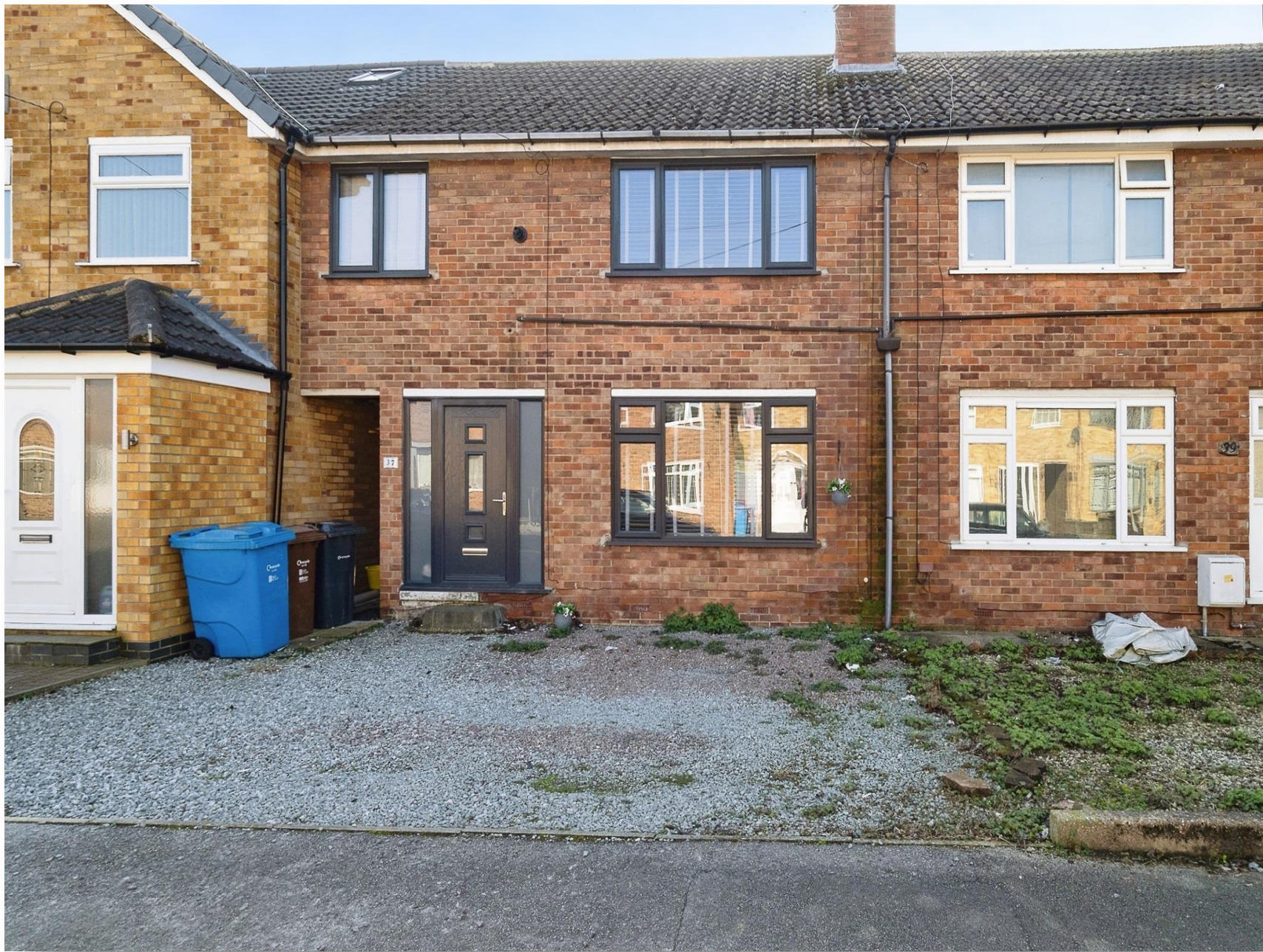
Stornaway Square, Hull, HU8 9LJ