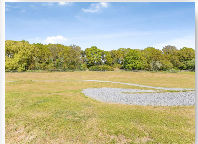
Elder Close, Hellesdon Norwich NR6 5FN