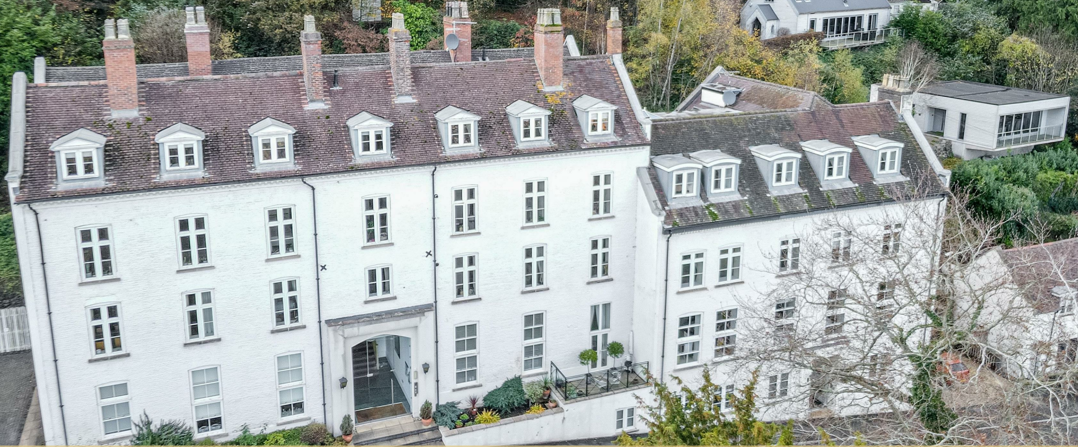
The Penthouse, Wells House, Malvern Wells Guide Price £340,000