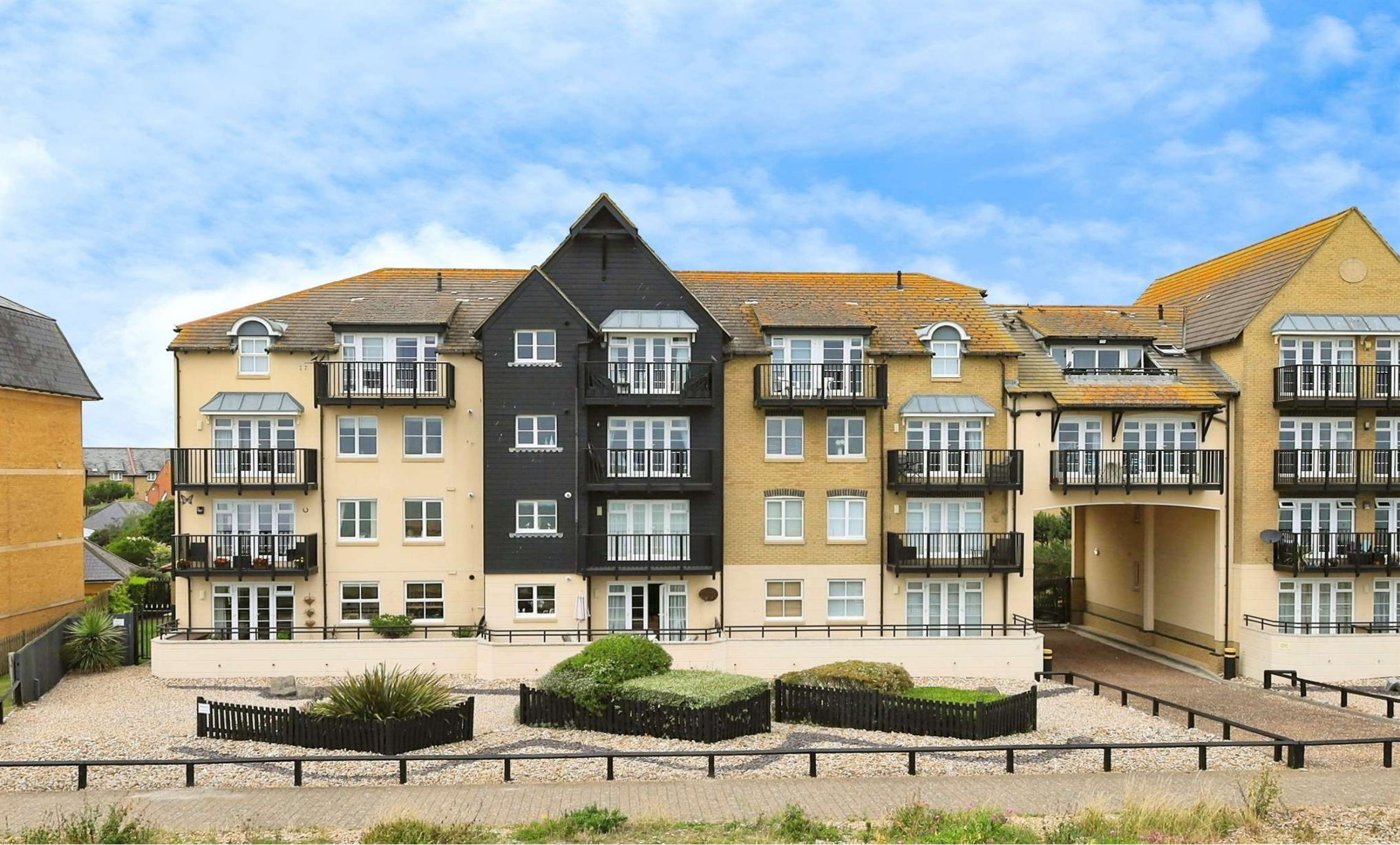
Admiralty Court Admiralty Way, Eastbourne BN23 5PW