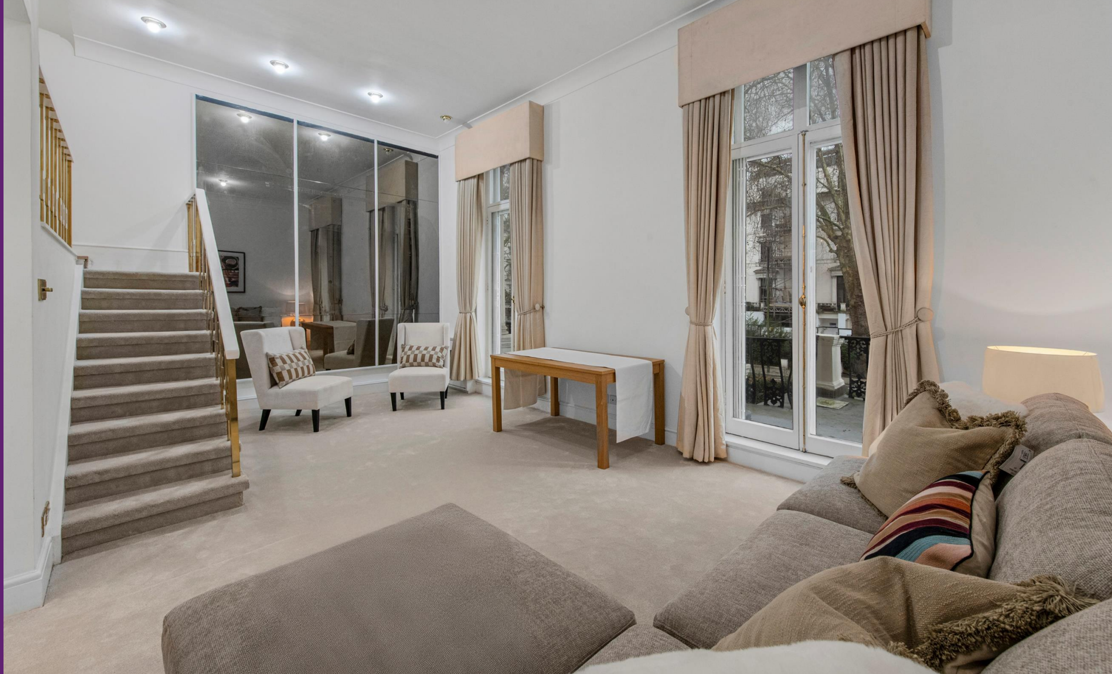
Westbourne Terrace Bayswater, W2