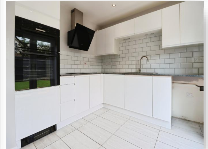
Melville Place, Boughton Northampton NN2 8FP