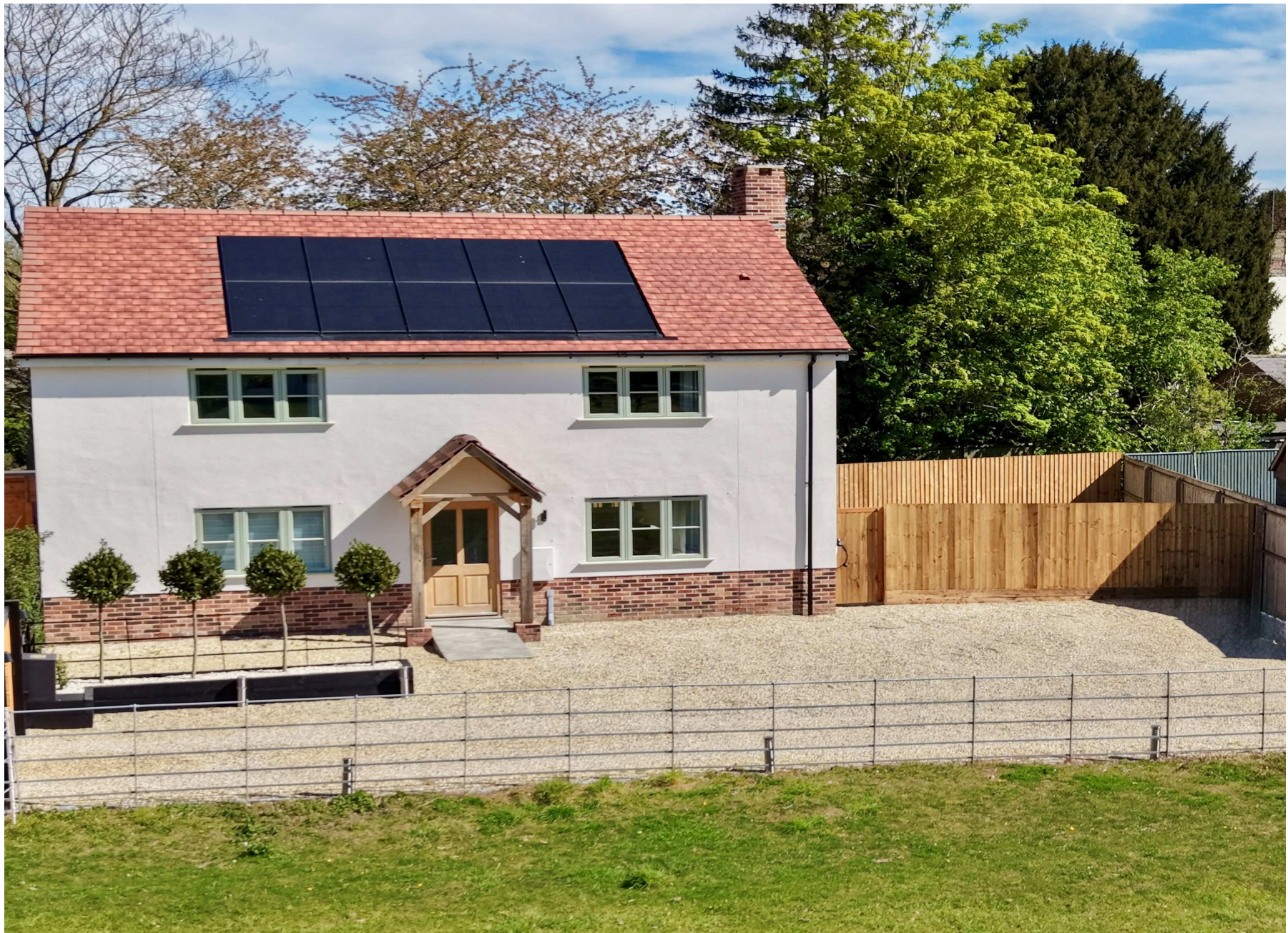
Plot 1 rear of 21 High Street, Harston CB22 7PX