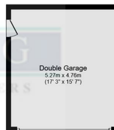
Double Garage Floor area 25.3 sq.m. (273 sq.ft.)

Total floor area: 144.7 sq.m. (1,558 sq.ft.)