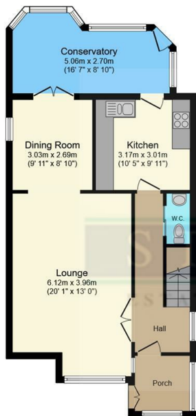
Ground Floor Floor area 69.0 sq.m. (743 sq.ft.)