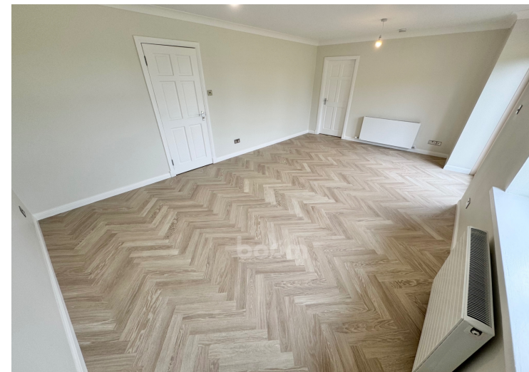
Selvieland Farm Cottages Houston Road, Houston