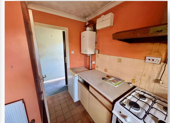
Lynn Road, Ingoldisthorpe, PE31 6NS