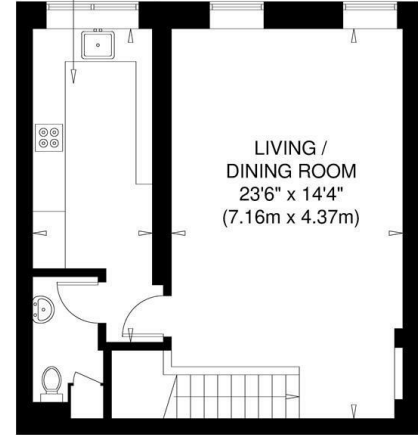
UPPER GROUND FLOOR GROSS INTERNAL FLOOR AREA 48.4 SQ M / 520 SQ FT