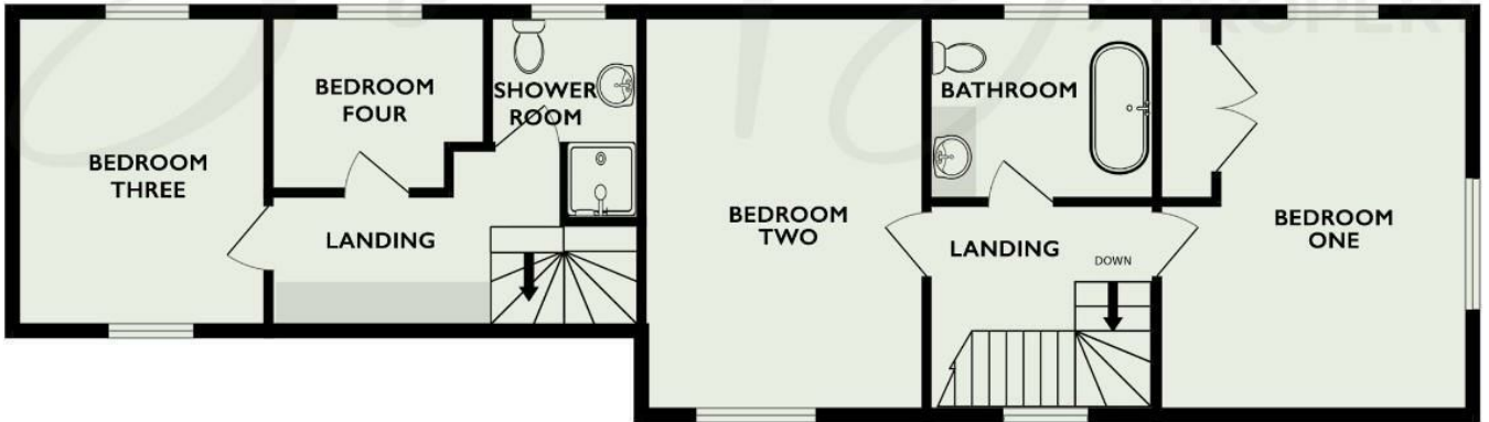
First Floor 813sqft (75.5sqm) approx.

TOTAL FLOOR AREA : 1716 sq.ft. (159.4 sq.m.) approx.