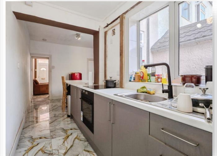
Berrisford Street, COALVILLE