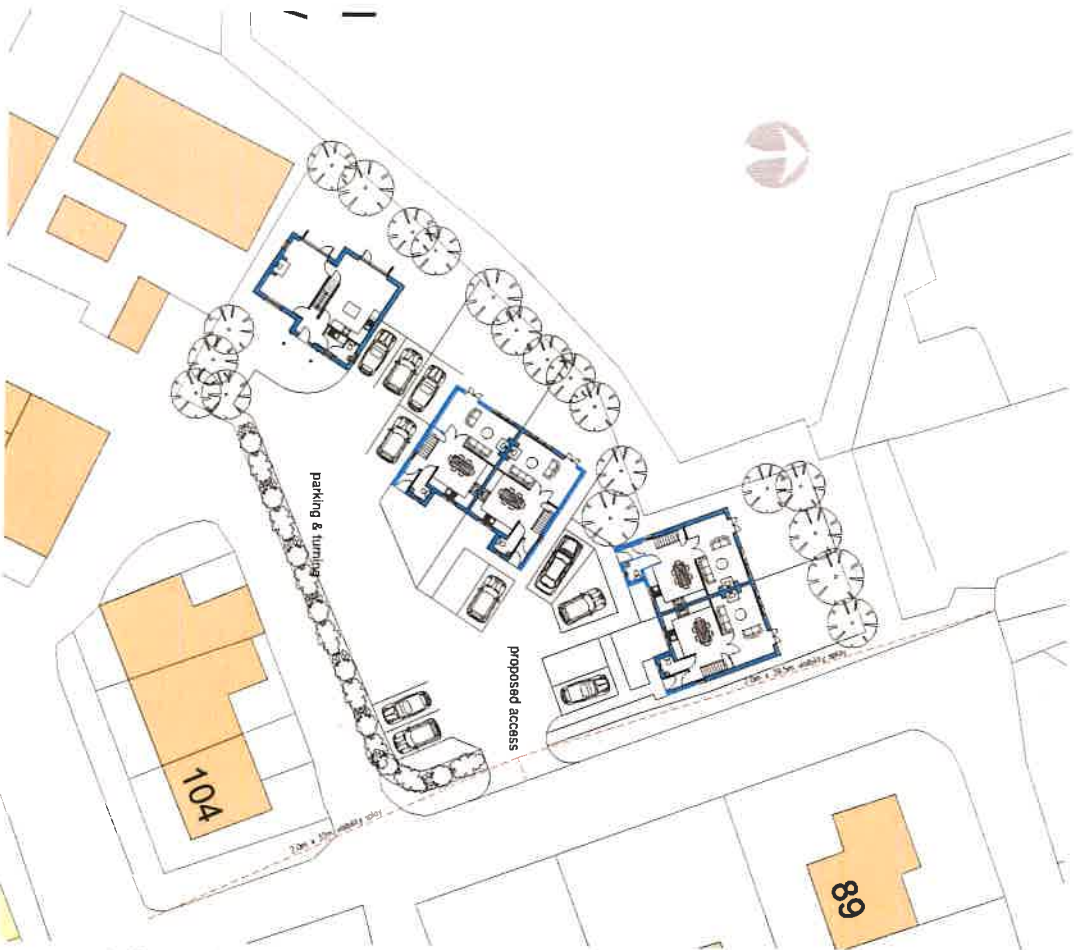
Ground Floor Site Plan SCALE 1:200

This drawing is for information purposes only. The number, size and location of the units are liable to change if outline planning approval is granted after the site has been fully surveyed and analysed.