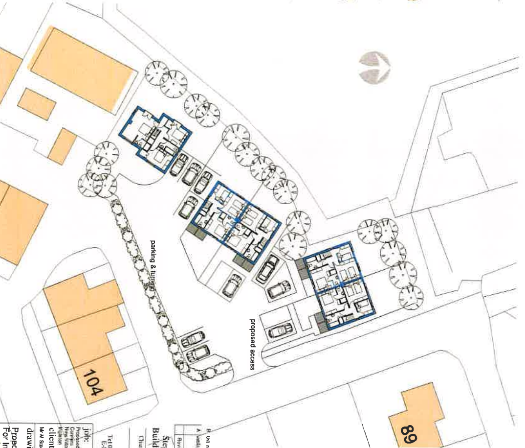
First Floor Site Plan SCALE 1:200