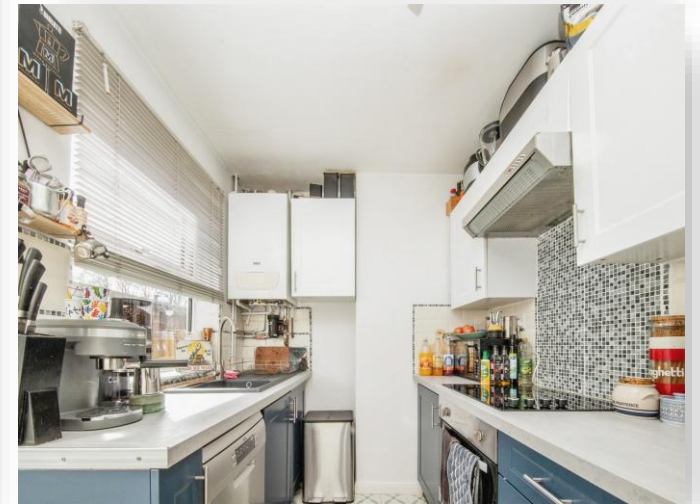
Bulstrode Road, Ipswich, IP2 8HA